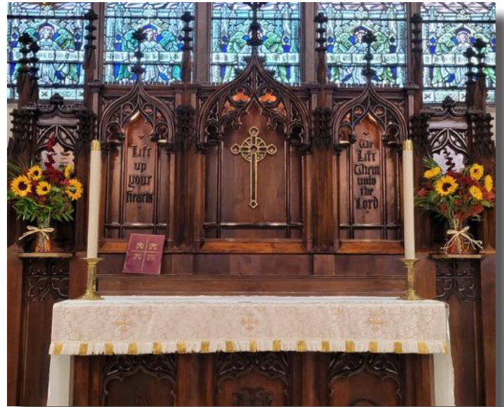
Photos of the church decorated for Harvest Festival 2022.

“Before this new wave of criminality, far too many Haitian children were already out of school and far too many children are now at risk of dropping out due to the fact that schools are dangerous. In Haiti today, every child who is left outside the classroom is more vulnerable to gang recruitment. The social impact of school dropouts for the future of the country cannot be overstated: Haiti needs more engineers to rebuild schools, more nurses to vaccinate newborns, more teachers to give classes. We need to find ways to bring children back to school and allow them to learn safely”, stressed Jean Gough.